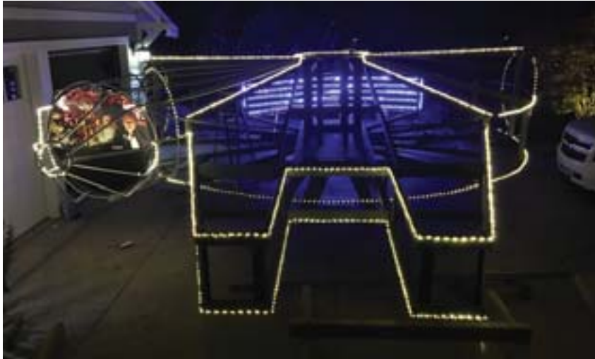
Running lights on and primed for liftoff!