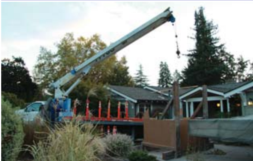
It helps to have a 70 foot crane for pre-launch

Watch Death Star and Millennium Falcon construction videos online at: https://www.youtube.com/watch?v=OT0RH4EAnLY&feature=youtu.be https://www.youtube.com/watch?v=fHzes5_tY&feature=youtu.be